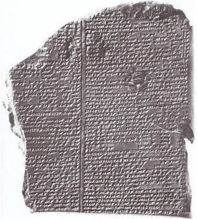
A fragment of a tablet showing the story of the flood, inscribed in Assyrian cuneiform characters.

-'Then was the launching full of difficulty; there was shifting of ballast above and below till two thirds was submerged. I loaded into her all that I had of gold and of living things, my family, my kin, the beast of the field both wild and tame, and all the craftsmen. I sent them on board, for the time that Shamash had ordained was already fulfilled when he said, "in the evening, when the rider of the storm sends down the destroying rain, enter the boat and batten her down." The time was fulfilled, the evening came, the rider of the storm sent down the rain. I looked out at the weather and it was terrible, so I too boarded the boat and battened her down. All was now complete, the battening and the caulking; so I handed the tiller to Puzur-Amurri the steersman, with the navigation and the care of the whole boat.